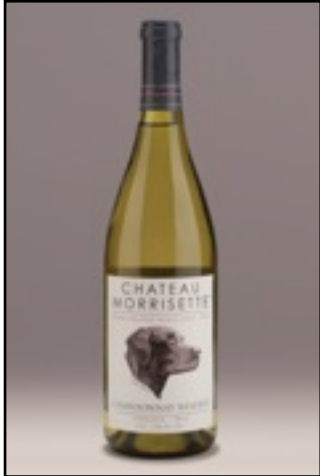
VIIGNIER UPC 012731198758