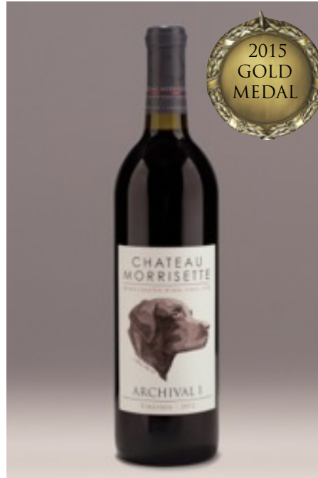
ARCHIVAL UPC 012731200093

The lovely brick red color of this wine is a sign of extended prerelease aging in barrel and bottle. The nose reveals subtle plum, cedar, cinnamon, and leather, and the palate adds to these a rich mocha flavor.