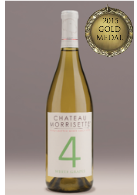
4 WHITE GRAPES® UPC 012731200086

Aroma: Floral aromas and key lime. Palate: Tangerine vanilla merengue, tropical fruit. Finish: Crisp offering of pear and quince. Blend of Chardonnay, Petite Manseng, Vidal Blanc, and Traminette