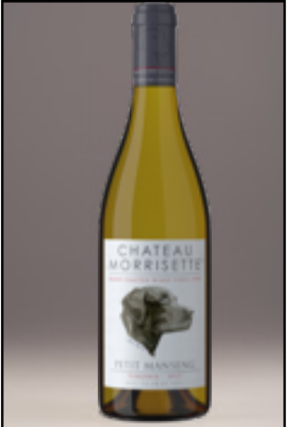
VINGRIS UPC 012731196105