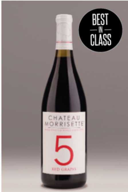
5 RED GRAPES® UPC 012731200086

Top Tier Wines are available in limited quantities and may not be available consistently year over year. These wines are best hand-sold in consultant stores or in more exclusive wine shops. Each of these wines carries a Virginia Appellation. Not all distributors carry our top tier wines.